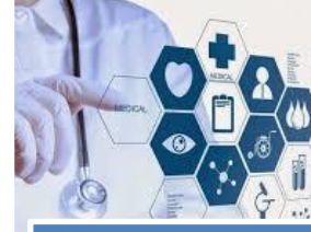
Clinical Decision Support

Feel free to navigate to our Inspira Health Partners website for additional information: