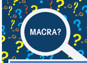
Quality Initiative Assistance