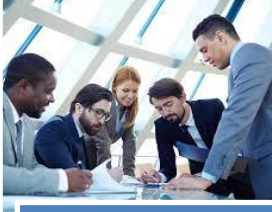
Practice Management Support

PHO Membership benefits and services at no additional charge include: